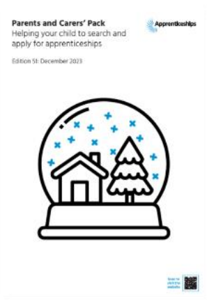
Amazing Apprenticeships: Regular information to support you and your child to search for apprenticeships: Parents & Carers' Pack December 23 - Amazing Apprenticeships