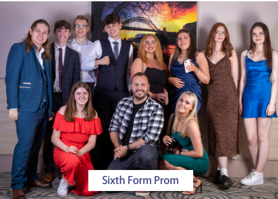
Sixth Form Prom