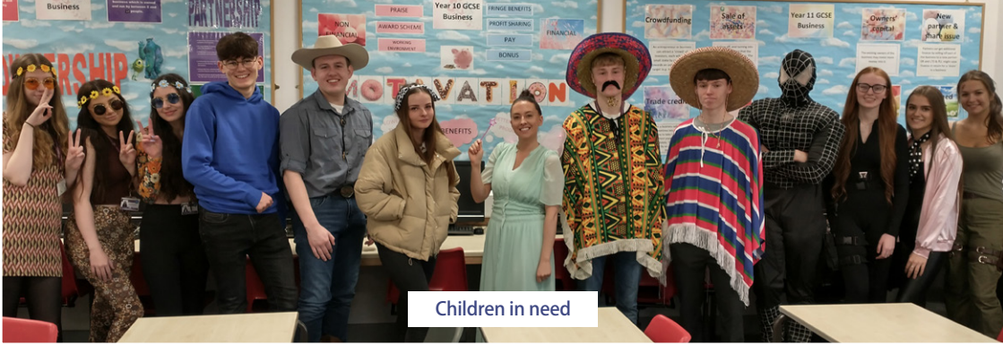
Children in need