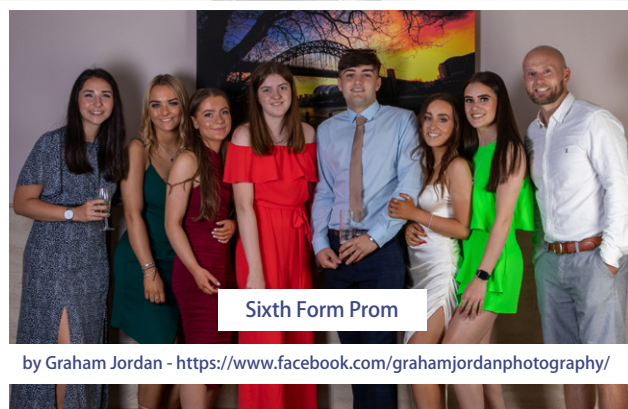
Sixth Form Prom