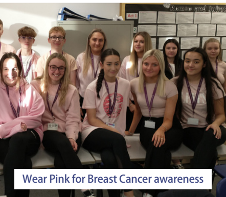
Wear Pink for Breast Cancer awareness