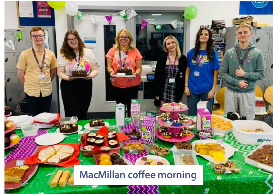
MacMillan coffee morning