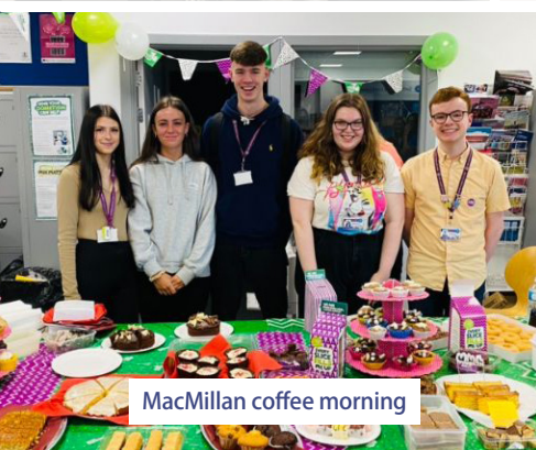
MacMillan coffee morning